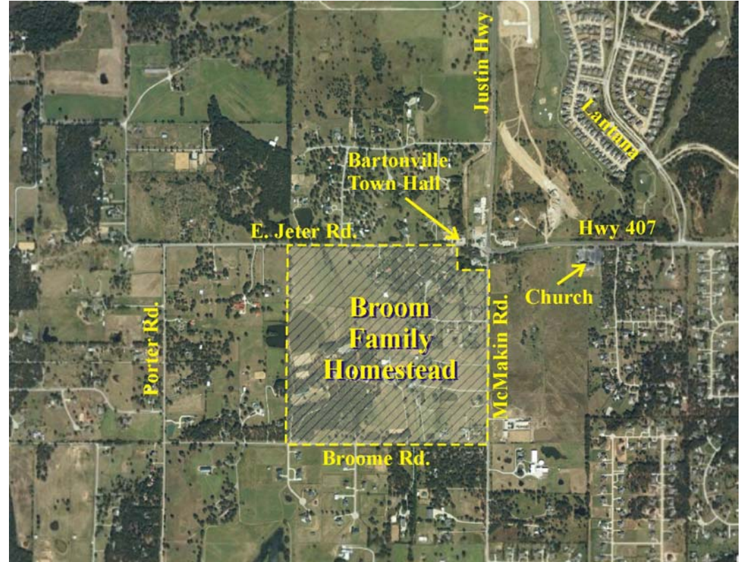
Location of the Broom Family Homestead